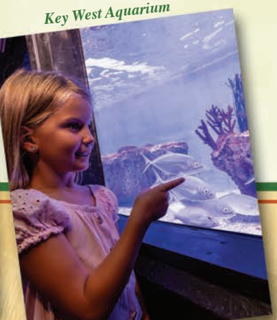
Key West Aquarium

Hemingway lived in Key West during his most productive years. We'll show you the home where he worked with a special introduction to the descendants of his cats. We'll also take you to where he played at Sloppy Joe's on Duval Street.