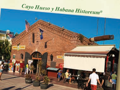
Cayo Hueso y Habana Historeum®

Audubon, Ernest Hemingway, Harry Truman, Tennessee Williams, Robert Frost and...You! We're glad you're here and we're excited to show you our beautiful island.