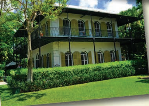
Mel Fisher's Maritime Museum