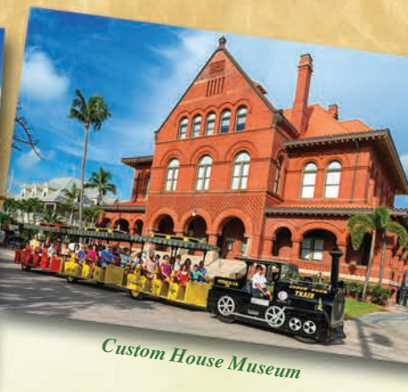
Custom House Museum