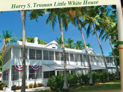
Harry S. Truman Little White House